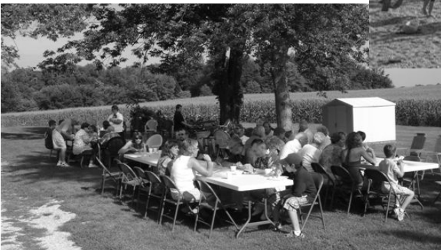
Weather in the nineties didn't curb our appetites for the wonderful church picnic food that we look forward to eating!!!