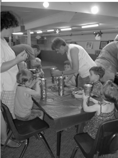
The children having fun singing lively songs and making crafty projects during SonForce 2007 Vacation Bible School